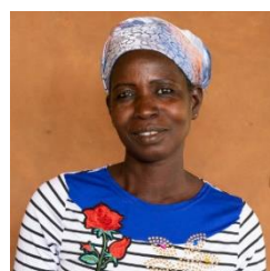
Scholastic Azure- Assistant to