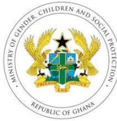
Department of Social Welfare