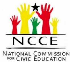
National Commission on Civic Education